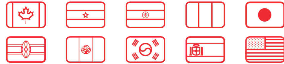
Canada | Ghana | India | Ireland | Japan Kenya | Mexico | South Korea | Spain | United States