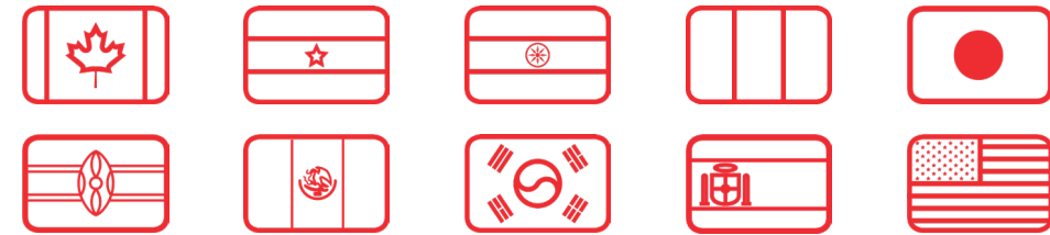
Canada | Ghana | India | Ireland | Japan Kenya | Mexico | South Korea | Spain | United States